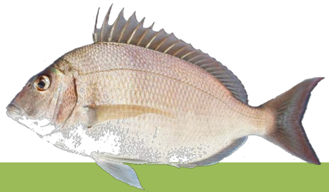
Scup or Porgy ( Stenotomus chrysops )